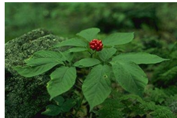
A Ginsenoside Marker Compound (Root)