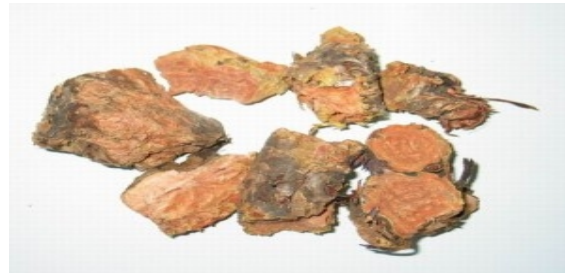
Rhodiola rosea Root Powder