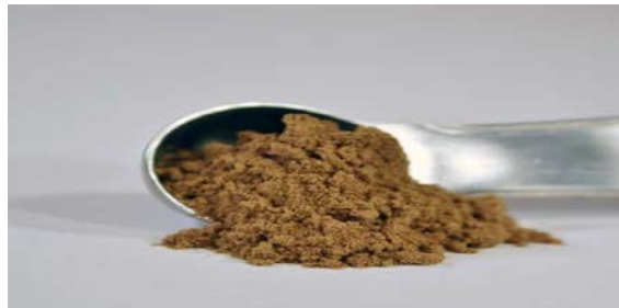
Rhodiola rosea Root Powder